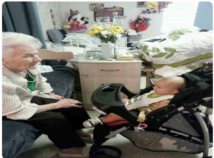
Grandma meeting her great grandson for the first time.